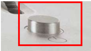
Pic. 5: On/Off button

If the unit is not in use for some time, please switch it off using the power switch on top of the device. Disconnect the device completely from the power supply by removing the mains plug from the socket.