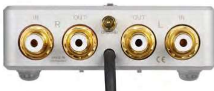
Pic. 4: Rear view

Now you can proceed with connecting the smart phono V2 / smart phono headphone V2 to your MC/MM cartridge and preamplifier. The input impedance (input load resistor / capacitance) can be adjusted according to the cartridge requirements, using the jumpers on the bottom of the unit. Finally, connect the power supply to the mains. For disconnecting, please follow these instructions in reverse order.