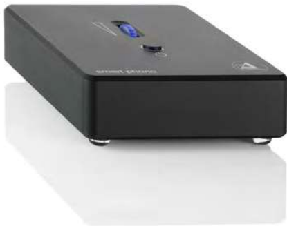
Pic. 1: Package contents