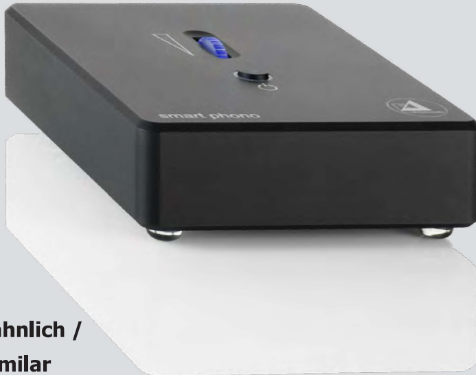
Abb. ähnlich / Pic. similar