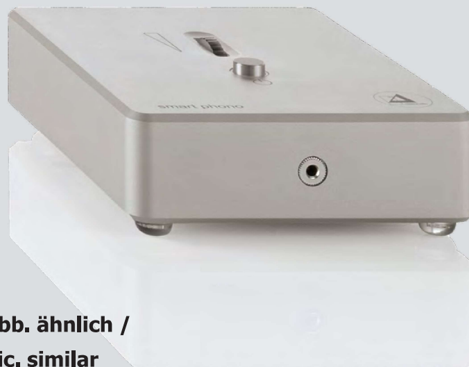
Abb. ähnlich / Pic. similar