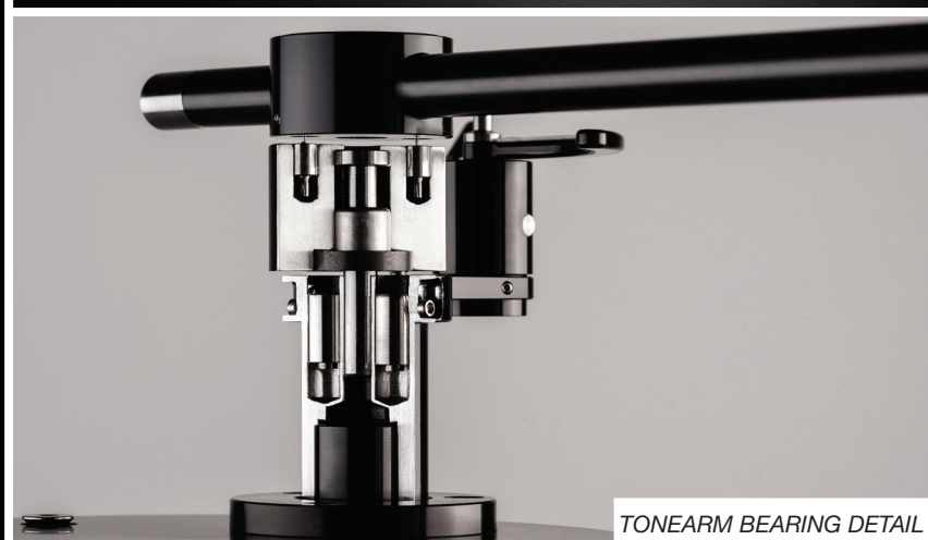
TONEARM BEARING DETAIL